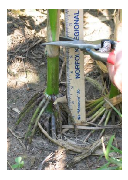
Figure 2. Samples should be taken 6 inches from the soil.

Dairy One Forage Lab 730 Warren Rd. Ithaca, NY 14850 Ph: 1-800-496-3344 Fax: 607 257-1350 Call ahead to ensure analysis.